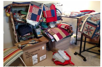
All Stages of a QFO Quilt.... fabric stash, kit, pinned for machine work, finished and ready to go, in an emptied batting box!